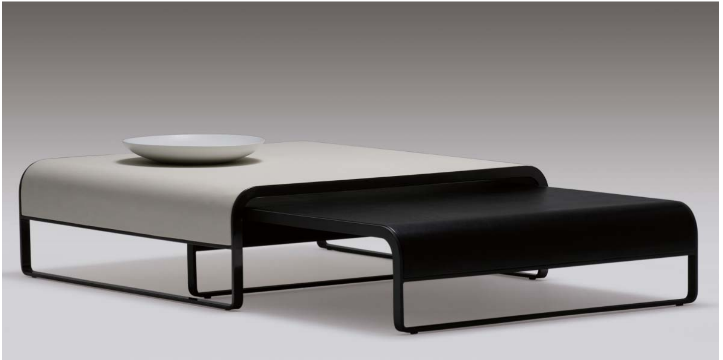
ERA / FRAME: Black fluorocarbon painted steel. TOP: Curved plywood top wrapped in P/FC, Q or R/RS leather.